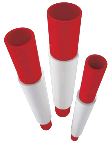
Three convenient sizes!