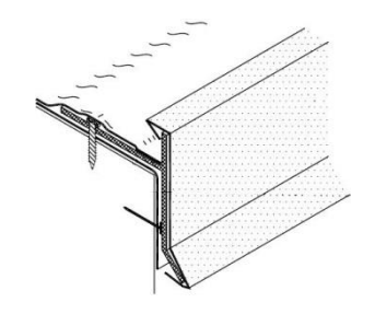
2" Gravel Stop Cover