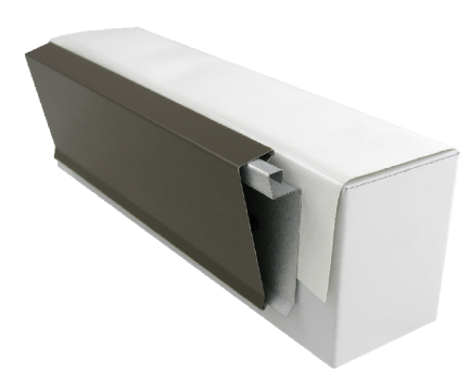
Fascia Base shown with 2-Piece Snap-On Compression Cover. -See 2-Piece Snap-On Compression Cover PDS for material gauge and finishes.