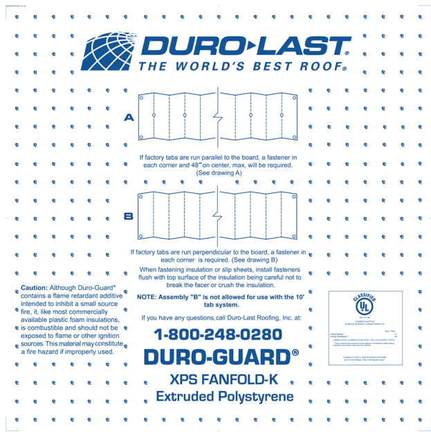
Figure 4. Partial view of facer on top surface