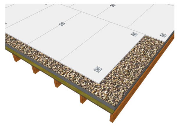
Figure 1. Duro-Guard XPS Fan Fold - K